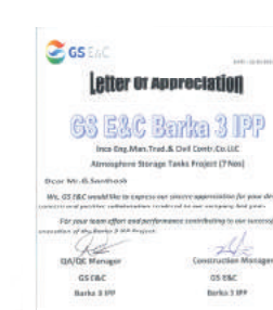
Letter of Appreciation Barka 3 IPP Project