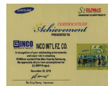
Certificate of Achievement S2 IWPP Project