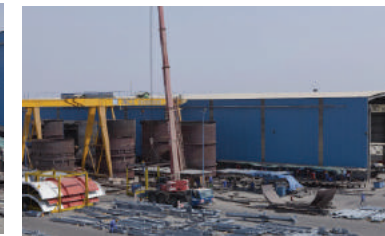
OMAN WORKSHOP -2 SOHAR