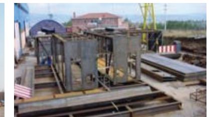
TURKEY WORKSHOP- GEBZE