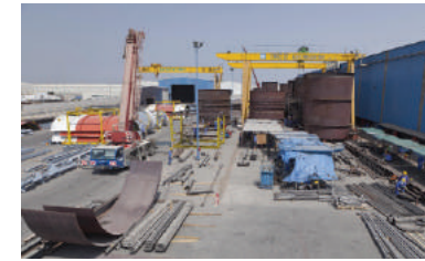
OMAN WORKSHOP -1 SOHAR