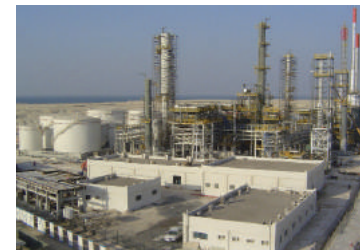
Linear Alkyl Benzene Plant