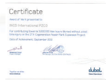
Certificate of Merit Dubai GTX Project