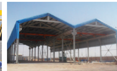
IRAQ WORKSHOP- ZUBAIR/ BASRA