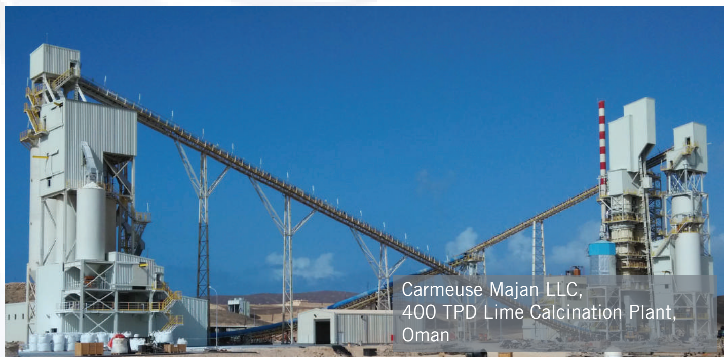
Carmeuse Majan LLC, 400 TPD Lime Calcination Plant, Oman