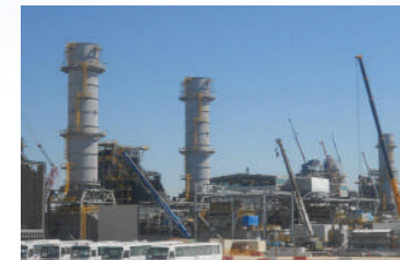
EMAL Power Plant