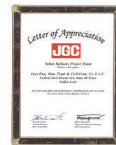
Letter of Appreciation Sohar Refinery Project