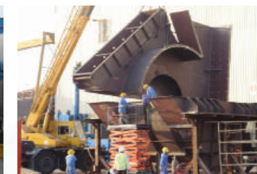
Iron Ore Pelletisation Plant