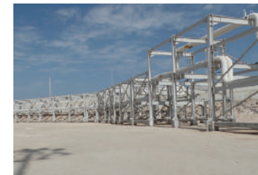
Bulk Liquid Storage Terminal Facility for Mina