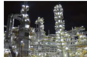
Sohar Refinery Improvement Project