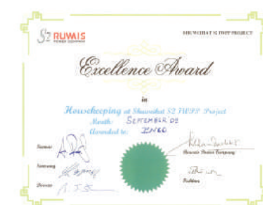
Excellence Award S2 IWPP Project