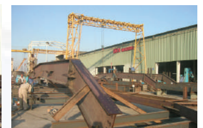
Anode Baking Furnace & Cathode Sealing Shop