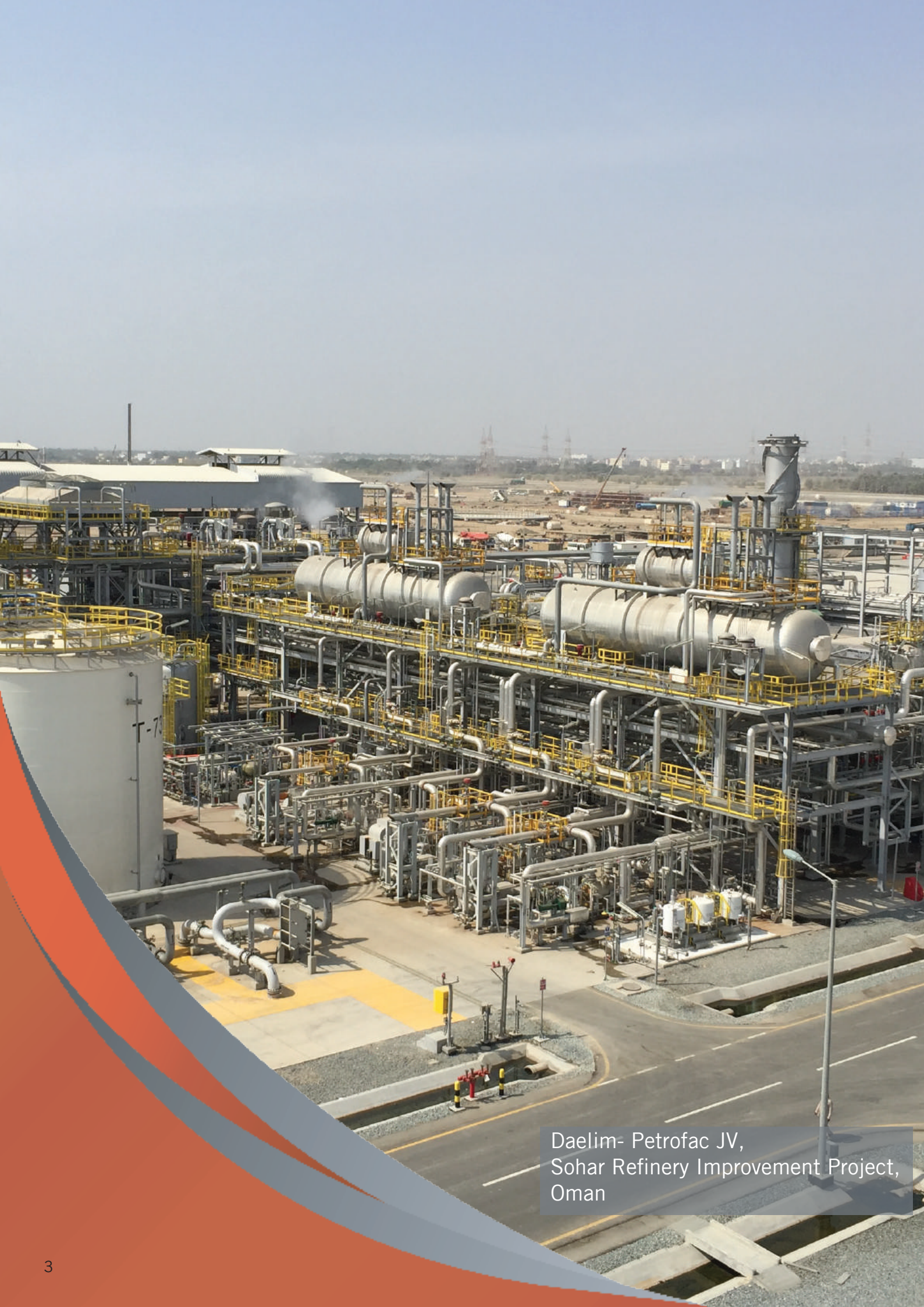
Daelim- Petrofac JV, Sohar Refinery Improvement Project, Oman