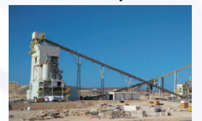
400 TPD Lime Calcination Plant Project