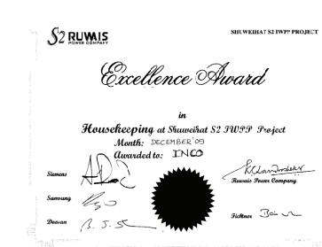
Excellence Award S2 IWPP Project