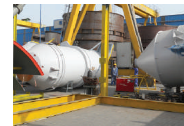
Aluminium Smelter Project