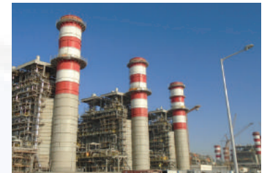
Umm Al Houl IWPP