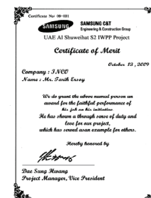
Certificate of Merit S2 IWPP Project