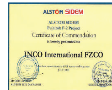
Certificate of Recommendation F2 IWPP Project