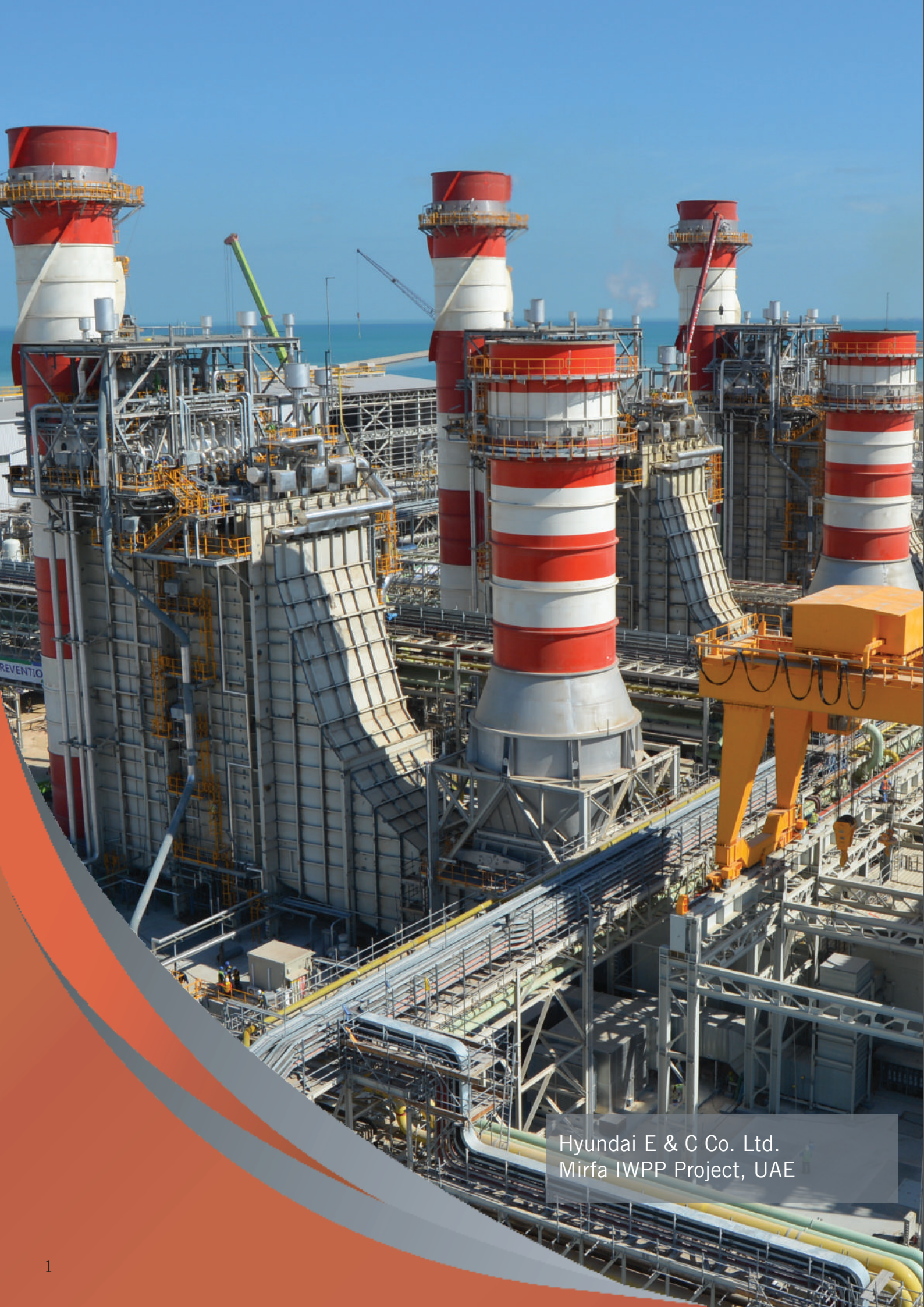
Hyundai E & C Co. Ltd. Mirfa IWPP Project, UAE