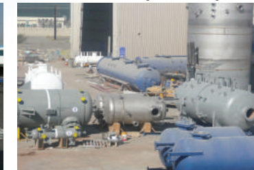
Jebel Ali & Qatar RAF Desalination Plant