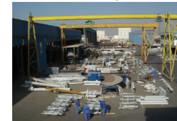
Qatar Waste To Energy Plant