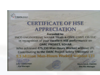
Certificate of Appreciation OARC Project