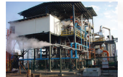
Vegetable Oil Plant