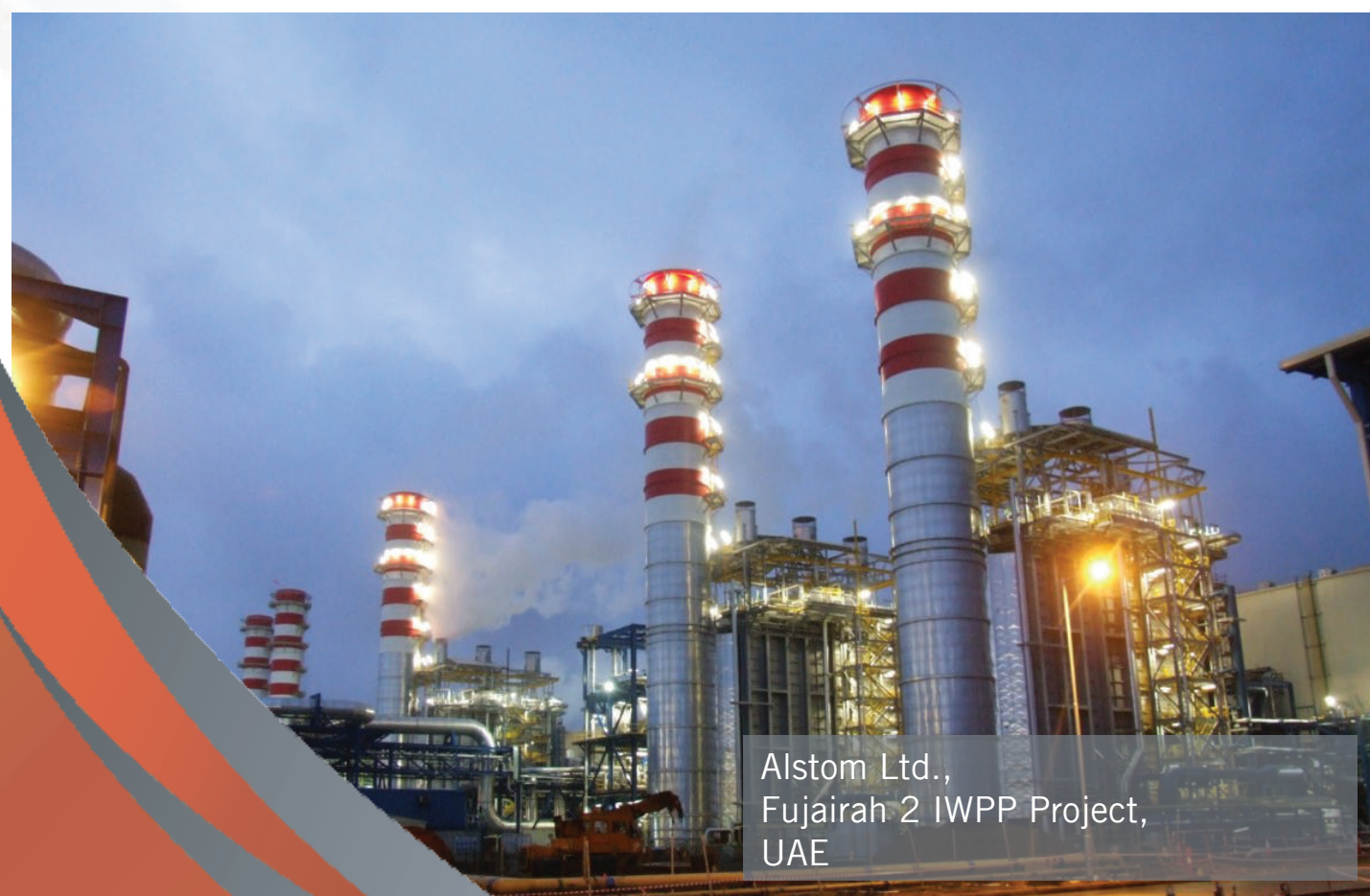
Alstom Ltd., Fujairah 2 IWPP Project, UAE