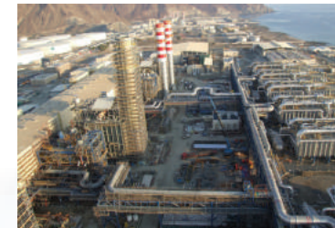
F2 IWPP Project