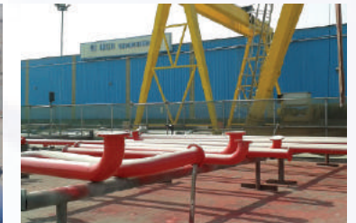
Piping Spool Fabrication For SRIP Project